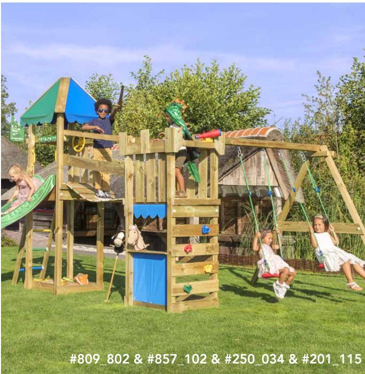
#809_802 & #857_102 & #250_034 & #201_115